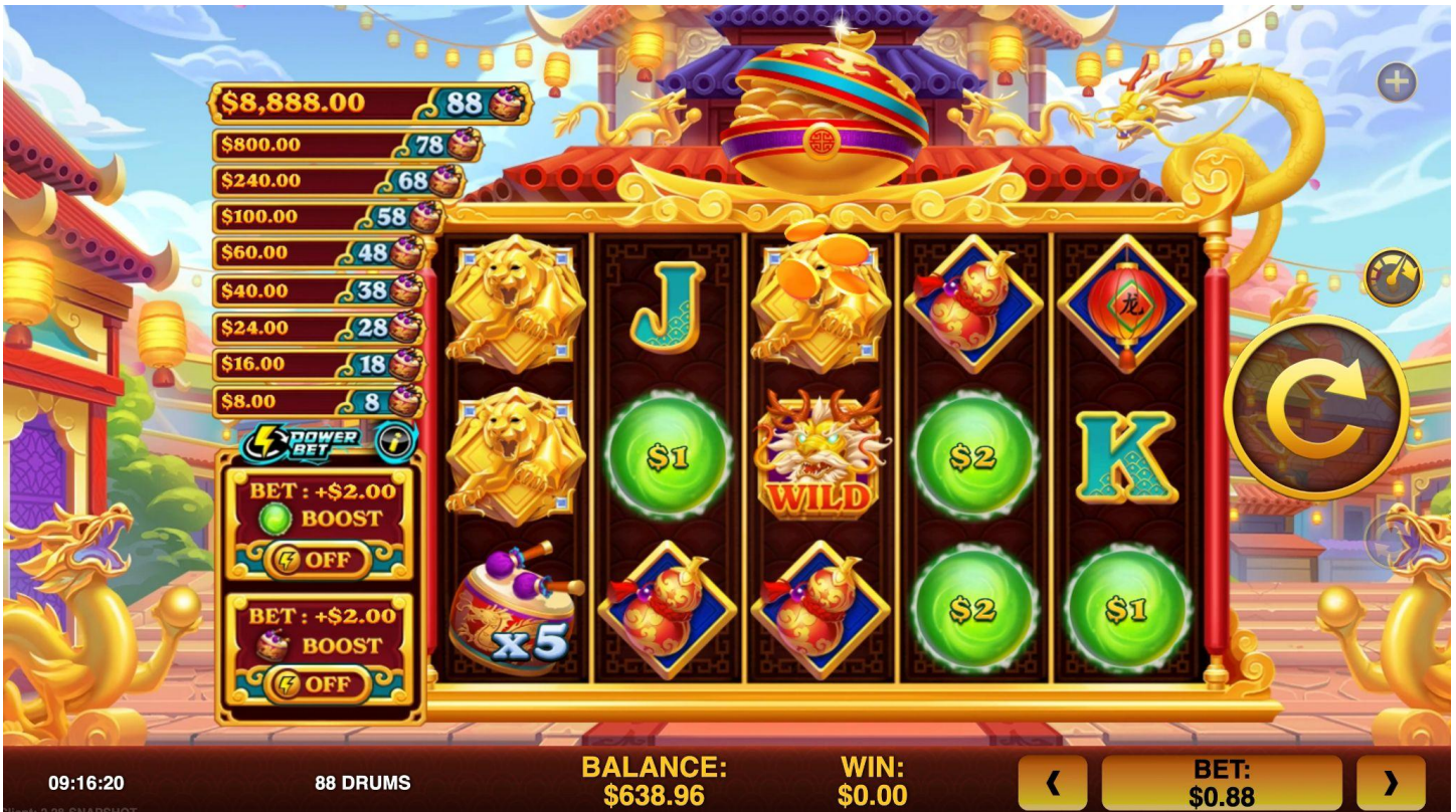
Example of Desktop Base Game

We are celebrating the Chinese new year like never before, with a game packed with exciting features that will reward players often and in very exciting ways with our Lootlink mechanic!