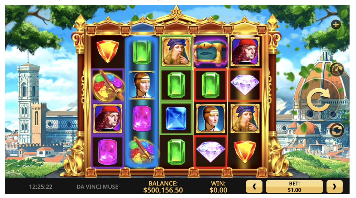
Example of desktop base game

Welcome to the world and time of DaVinci! A gameplay full of features and treasures straight from the Renaissance! Play at your own pace, as your progress will last... centuries!