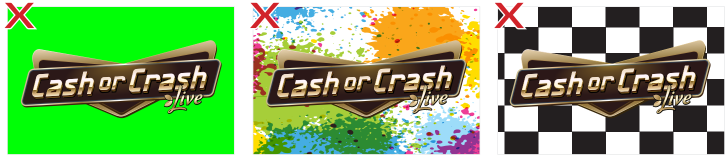
Bright neon colours

1. The logo should not be used on a background that dominates it and makes the logo difficult to read. Please DO NOT use neon or highly contrasting backgrounds as per the below examples: