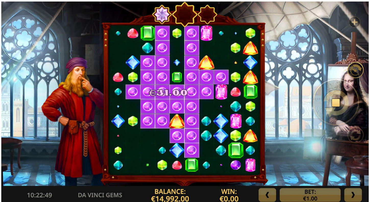
Example of Desktop Base Game

Da Vinci is back with High 5 Games Clusterbucks mechanic that will help players rack up riches again and again! Set in a truly renaissance ambience, Da Vinci will delight users once again!