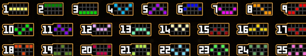
25 Lines Game

LINE WINS BEGIN WITH THE LEFTMOST REEL AND PAY LEFT TO RIGHT ONLY ON ADJACENT REELS.