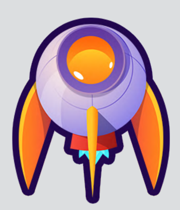
Rocket 3 Possible multiplier values: 25x, 50x, 75x