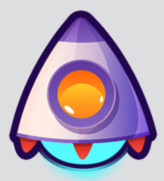
Rocket 2 Possible multiplier values: 10x, 15x, 20x