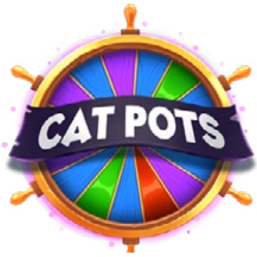
CAT POTS BONUS SCATTER