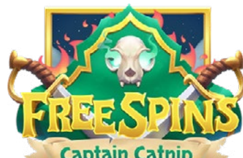
FREE SPINS CAPTAIN CATNIP