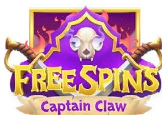
FREE SPINS CAPTAIN CLAW