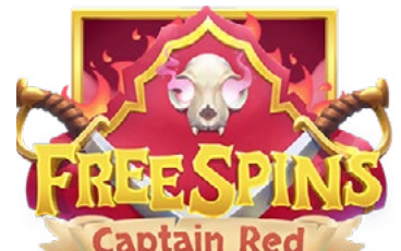
FREE SPINS CAPTAIN RED