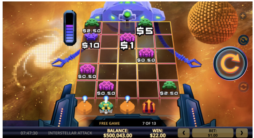
Examples of Mobile/Desktop Base Game and Desktop Bonus Round

Everytime you hit your enemies, there's a reward! Different ships with different shooting power and a collection of Sticky Power-Ups will help you hit more symbols and/or achieve greater payouts in 1 go! Keep your players engaged with our industry-known Spin-crease feature that upgrades symbols values, and have them back to play where they left off thanks to the persistent state that saves user progression!