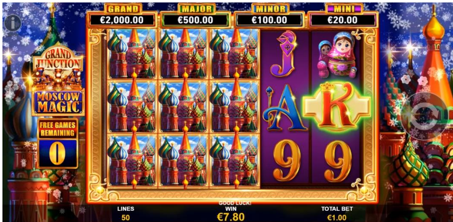
10. Free Games Stacked WILD symbols.