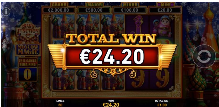
11. Total Win Display At the end of Free Games