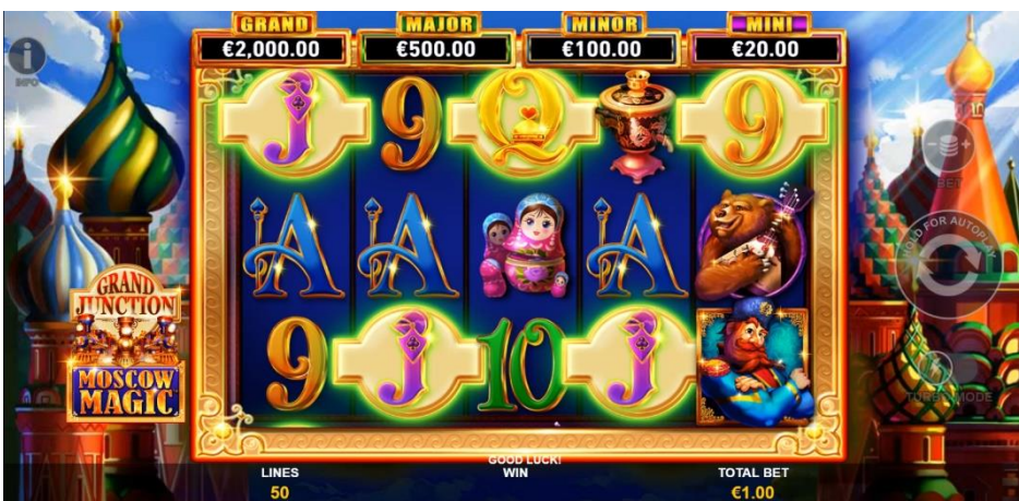
12. Grand Junction Feature Trigger 5 Scattered watermarked symbols