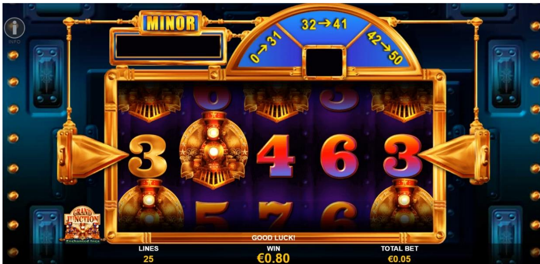
17. Bonus game Result

All numbers are added up to determine amount won from Minor Bonus amount. TRAIN symbol will animate to reveal a "high" number