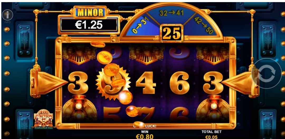
18. Final Result

All numbers are added up to determine amount won from Minor Bonus amount. TRAIN symbol will animate to reveal a "high" number