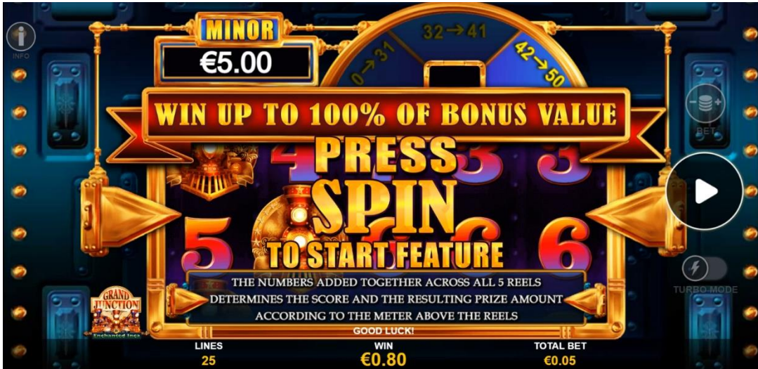
16. Intro into Bonus game explaining the details