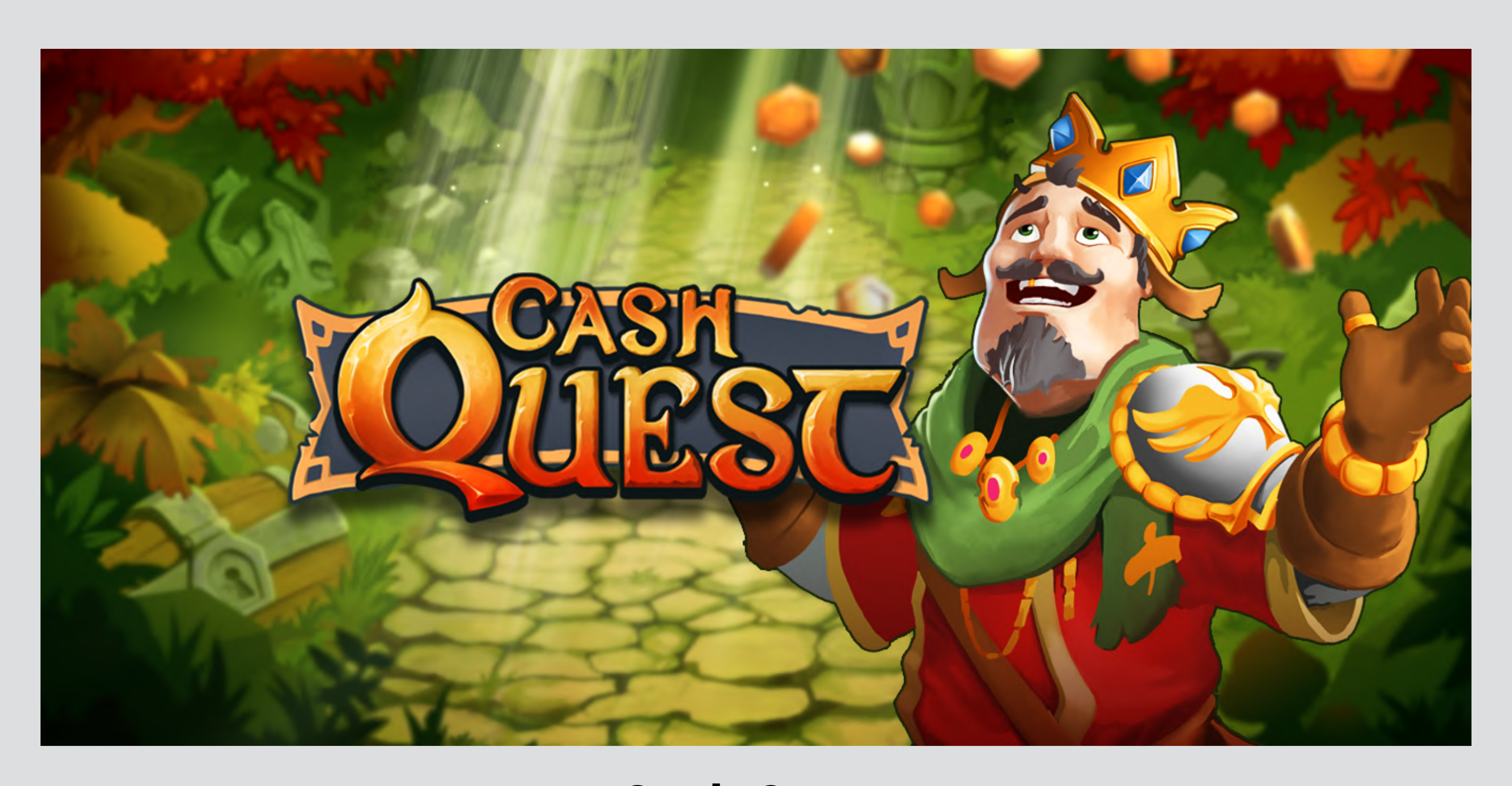
Cash Quest Game ID: 1099/1100/1101/1111