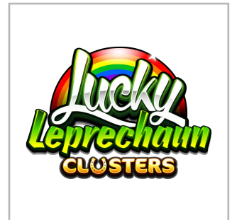
Logos supplied in English, Chinese, Korean, Thai, Vietnamese