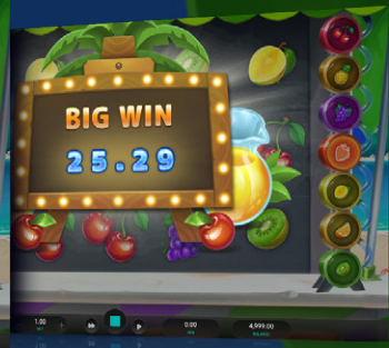
BIG WIN (Bet Multiplier 15+) 1 in 98