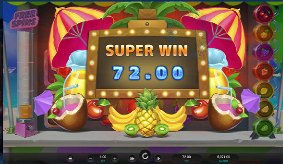
SUPER WIN (Bet Multiplier 60+) 1 in 1337