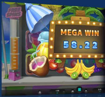
MEGA WIN (Bet Multiplier 30+) 1 in 270