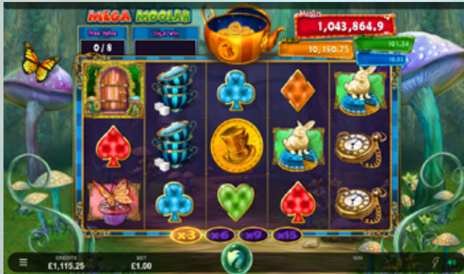
3 Free Spin or Wild Symbols Trigger Free Spins