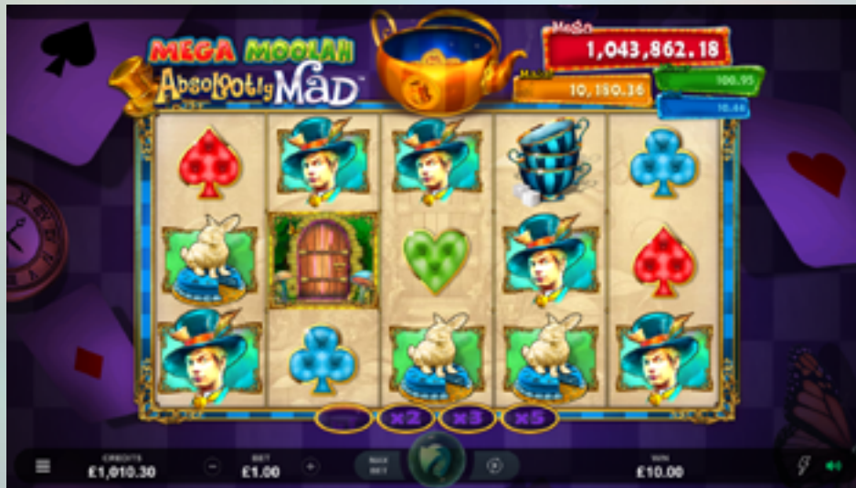
Base Game Rolling Reels™