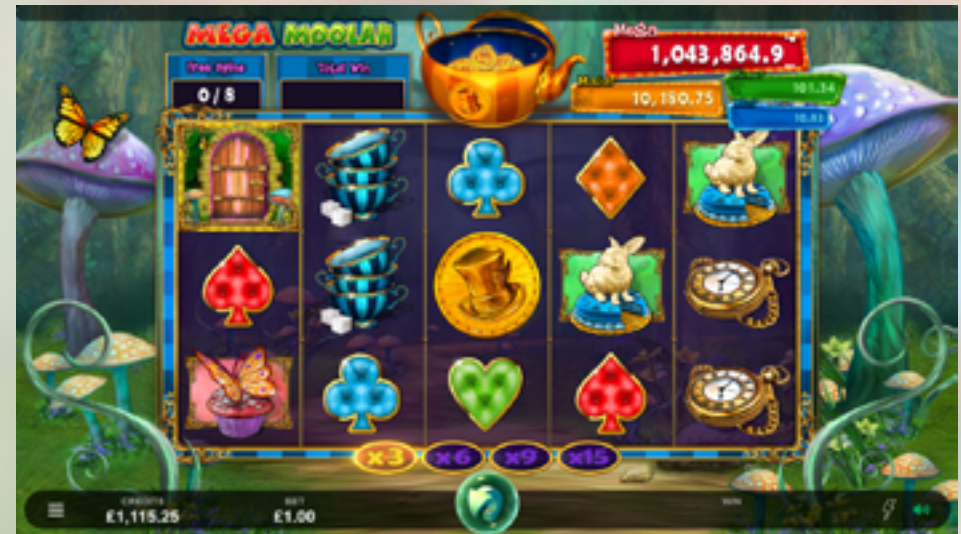
Free Spins Rolling Reels™ with 3x Larger Multiplier Trail