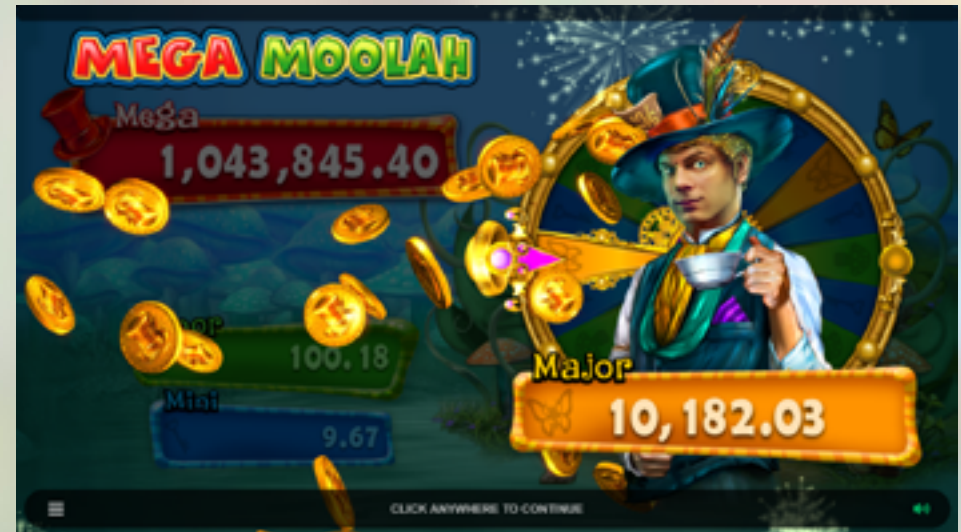
Major Jackpot Win