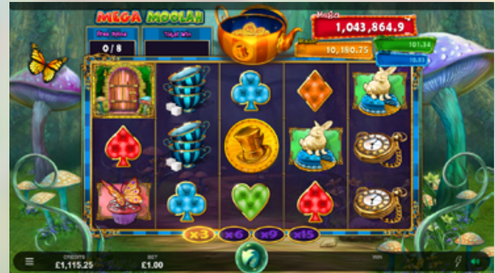
Higher Multiplier Trail in Free Spins